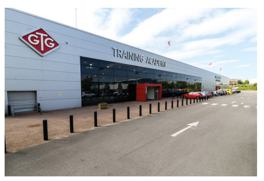
GTG West Midlands