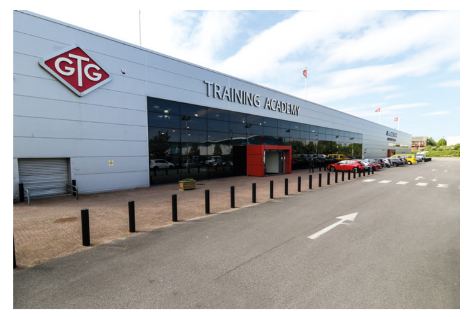
GTG West Midlands