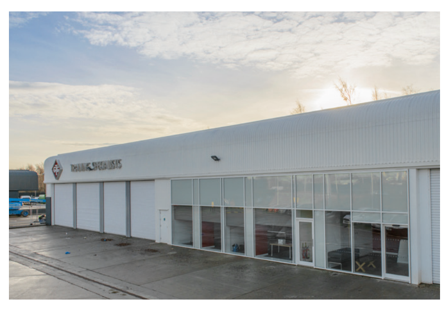
GTG Kilbirnie Street