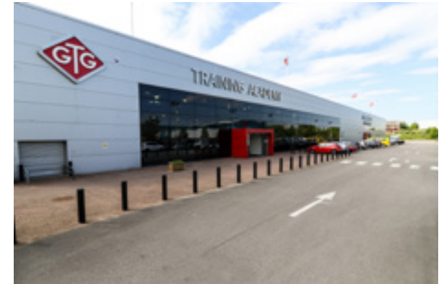
GTG West Midlands